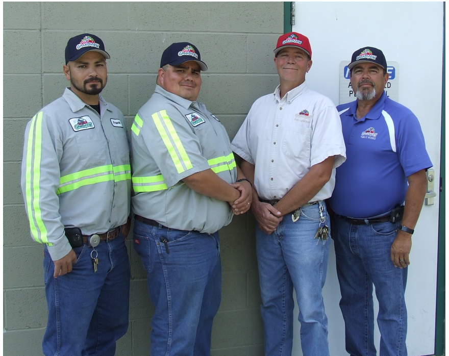
City of Grandview Water Plant Operators

In 2020 the Public Works Department collected a total of 233 water samples and monitored for over 100 contaminants. When contaminants are detected they are typically below the levels that EPA has established.