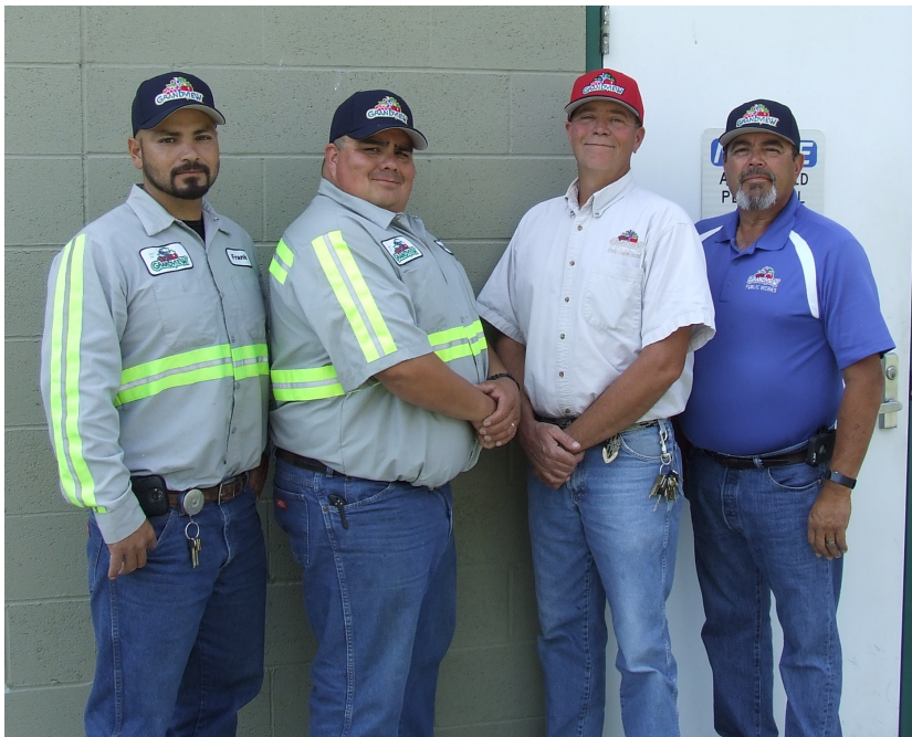
City of Grandview Water Plant Operators

In 2019 the Public Works Department collected a total of 230 water samples and monitored for over 100 contaminants. When contaminants are detected they are typically below the levels that EPA has established.