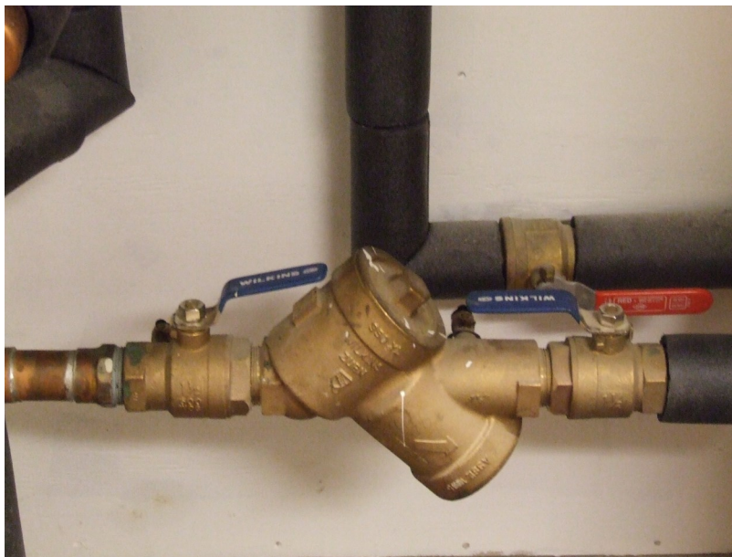
Backflow Assembly Device

All customers that irrigate with domestic water are required to comply with all state and city mandated regulation programs.