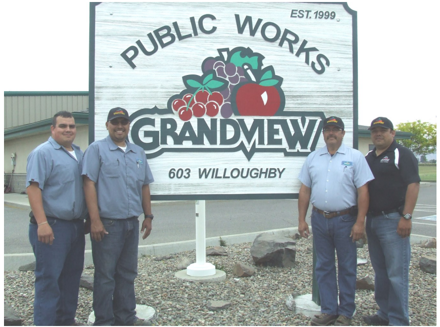
City of Grandview Water Maintenance Technicians

In 2012 the Public Works Department collected a total of 181 water samples and monitored for over 100 contaminants. When contaminants are detected they are typically below the levels that EPA has established.